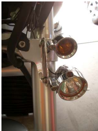
Dual Light Mount