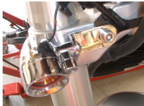
Single Light Mount