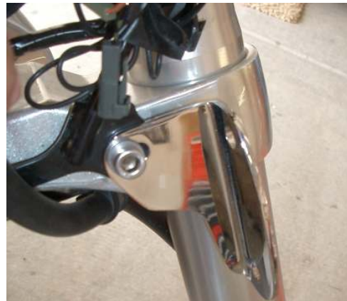
Dual Light Mount